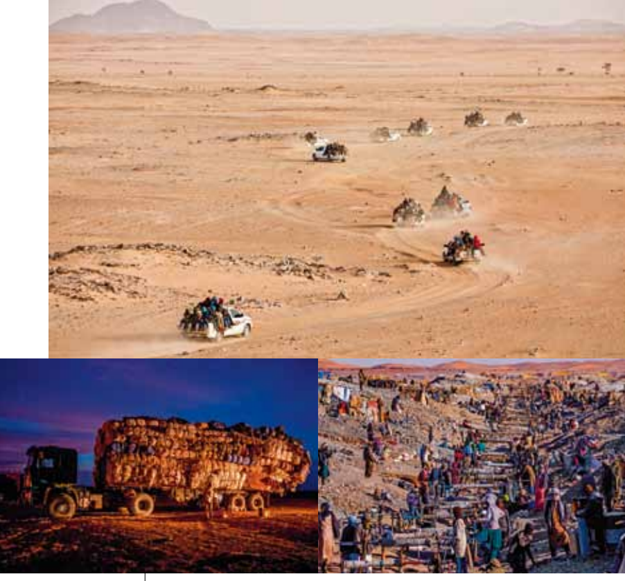
The Sahel in Danger – A Time Bomb

∧ / ildlife tourism has changed dramatically in the age of modern technology and telecommunications, with everyone wanting a digital souvenir to share in real time via social media. But behind the scenes is the suffering hidden from the eyes of the average traveler. The images of animals exploited for the entertainment of tourists are from different areas in the Amazon, Thailand and Russia. The report is designed to raise awareness so that people stop and think before supporting such operations and before posting images likely to encourage abusive interactions with wildlife. Exhibition co-produced by Icade Église des Dominicains