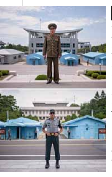
The Koreas - Across the Peninsula

orth and South Korea are but one step apart, yet for a journalist traveling between the two it is a journey of some 2000 kilometers, a distance symbolizing their divergent paths. The Korean peninsula is a paradox, a 71-year stand-off between two diametrically opposed systems unable to ignore or accept the other. Starting in 2012, Ed Jones gradually gained access to North Korea, witnessing large-scale, staged events. Now based in Seoul in South Korea, he has been making regular visits to Pyongyang since 2016 when AFP opened an office there. Couvent des Minimes