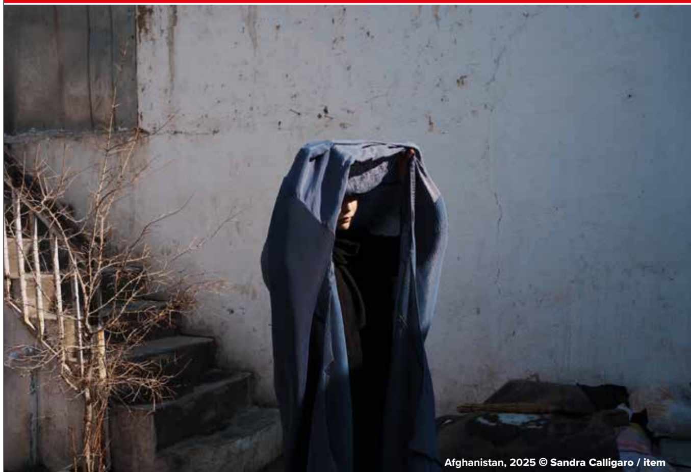
Afghanistan, 2025