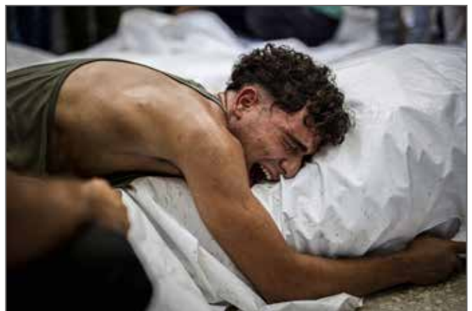
Winner of the 2025 ICRC Humanitarian Visa d'or Award