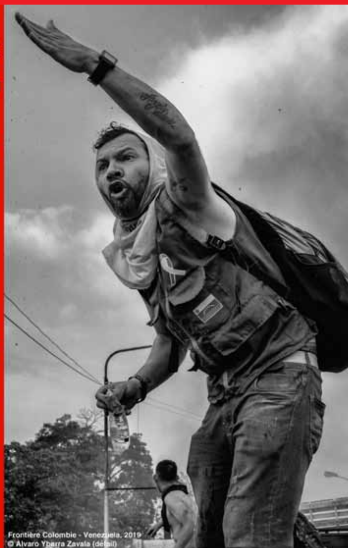
Frontière Colombie - Venezuela, 2019 © Alvaro Ybarra Zavala (défil)

31 e FESTIVAL INTERNATIONAL DU PHOTOJOURNALISME