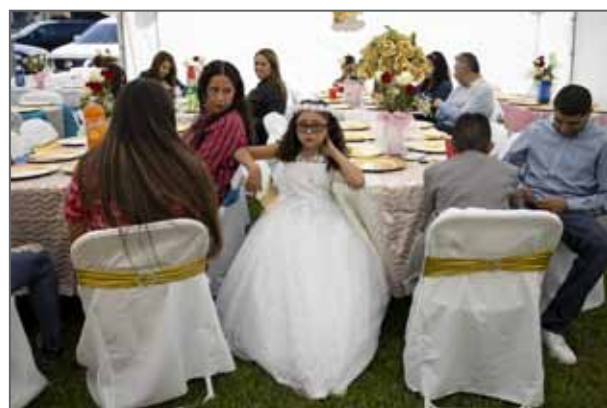
Winner of the 2018 Canon Female Photojournalist Grant

Two communities living side by side in California's Bay Area illustrate the income inequality divide in America. Palo Alto and East Palo Alto meet on University Avenue which runs through the heart of both cities. Palo Alto has the fortunes from Silicon Valley, while in East Palo Alto almost one fifth of residents are living below the poverty line in a community with low-income status dating back in history to racial discrimination in housing. Here is a story of two neighboring communities and everyday life in the shadow of the technology giants.