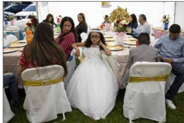
Winner of the 2018 Canon Female Photojournalist Grant

Two communities living side by side in California's Bay Area illustrate the income inequality divide in America. Palo Alto and East Palo Alto meet on University Avenue which runs through the heart of both cities. Palo Alto has the fortunes from Silicon Valley, while in East Palo Alto almost one fifth of residents are living below the poverty line in a community with low-income status dating back in history to racial discrimination in housing. Here is a story of two neighboring communities and everyday life in the shadow of the technology giants.