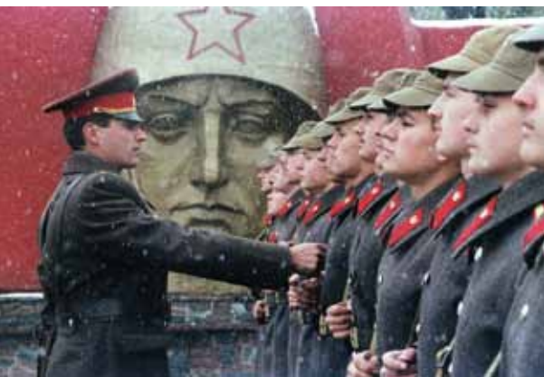
Ukraine, from Independence to War