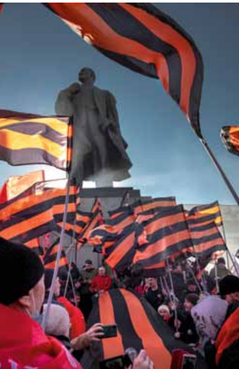
Behind the Z Curtain

The news on February 24 came as a shock for the 90% of Russians who were convinced that there would be no war with Ukraine. Within the first few weeks of the invasion, independent media were silenced, access to the Internet was restricted, protestors were arrested, and many citizens chose to leave the country. This left the official media focusing on past military glory and the increasing militarization of Russian society.