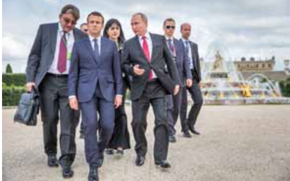
JEAN-CLAUDE COUTAUSSE On the Campaign Trail

“ I no longer present politics as a comedy; I stopped doing that when I realized that the people in front of me were characters from a tragedy.”