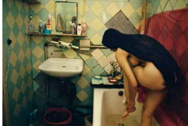
Discretion

Moving from backstage during a fashion parade to exploring Africa and Siberia, or even old communal apartments in Saint Petersburg, Françoise Huguiet has spent forty years following her curiosity across the world, discovering people, uncovering parts of history, with subtlety and discretion.