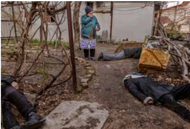
Тут жили люди People Lived Here