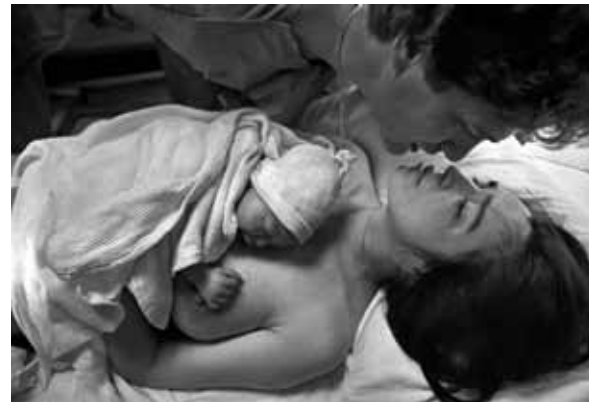
EUGENE RICHARDS An Outsider

As an outsider, particularly so given the current state of journalism in the United States, Eugene Richards embarked on an exploration of different ways of working, starting with fifty years of archives of his unpublished pictures, then combined with his first ventures on Instagram. Clearly Visa pour l'Image was duty bound to present an exhibition of a selection of these works from the past by a truly great photographer.