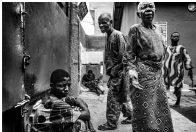
VALERIO BISPURI Nelle stanze della mente

After a photographic exploration of prisons in South America and Italy, Valerio Bispuri has pursued his work on freedom lost, this time delving into the realms of mental illness in Africa: in Zambia, Kenya, Benin and Togo. The work presented raises the question of mental distress and suffering, showing people considered to be “mad” and the way they are seen, or rather not seen but hidden away, locked up and often abandoned.