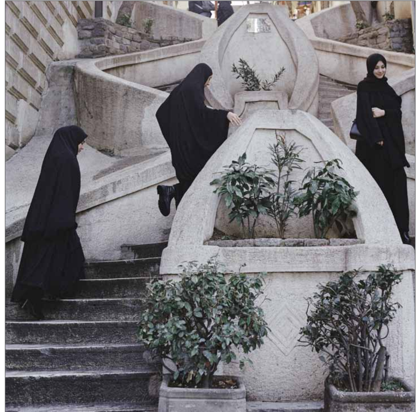
© Sabiha Çimen Winner of the 2020 Canon Female Photojournalist Grant