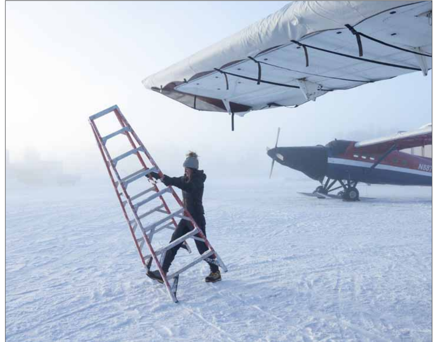
Winner of the 2021 Canon Female Photojournalist Grant

As one pilot told me, "So much happened before the time of airplanes, and so much will happen after the time of airplanes." As the aviation industry undergoes rapid changes with skyrocketing insurance costs, advances in electric aircraft, and the recent approval of cargo drones, the future of flying in Alaska is uncertain.