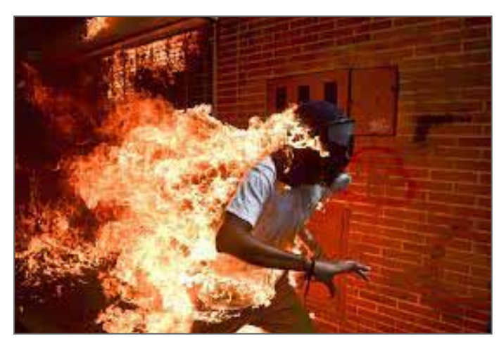
World Press Photo of the Year

The reference competition for photojournalism around the world, with Perpignan as the ultimate venue for the exhibition.