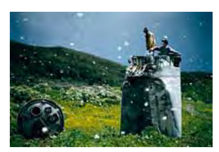
© Jonas Bendiksen @magnumphotos - Satellites