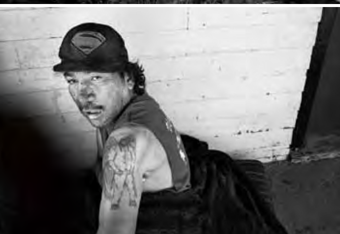
Canon Female Photojournalist Award 2016 supported by ELLE Magazine Dreamers

Pine Ridge Indian Reservation is said to be the poorest place in America, with 85% unemployment and the country's worst life expectancy: 47 years for men and 52 for women. The community is struggling with the scourge of alcohol abuse and methamphetamine. The report focuses on tribal members, led by women activists, tackling social problems, and embracing Lakota culture.