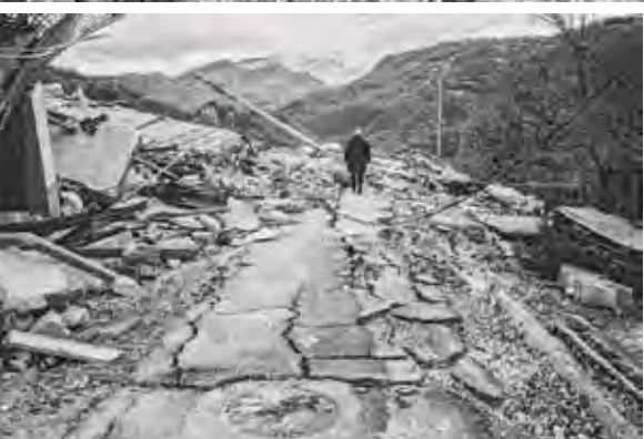
EMANUELE SCORCELLETTI for Le Figaro Magazine Italy Rent Asunder

August 24, 2016. An earthquake of magnitude 6.2 struck the Marche region of Italy, killing 300. It was the first in a horrifying series of quakes that went on and on until January 18 this year: six months of dramatic movements devastating provinces, razing dozens of villages and forcing more than 40,000 people to flee their homes. Here, in the aftermath, are phantoms of Italy as seen by Emanuele Scorcelletti over a number of trips across the land torn asunder. These impressive scenes of destruction reveal part of the soul and heritage of the country so palpable even when reduced to rubble.