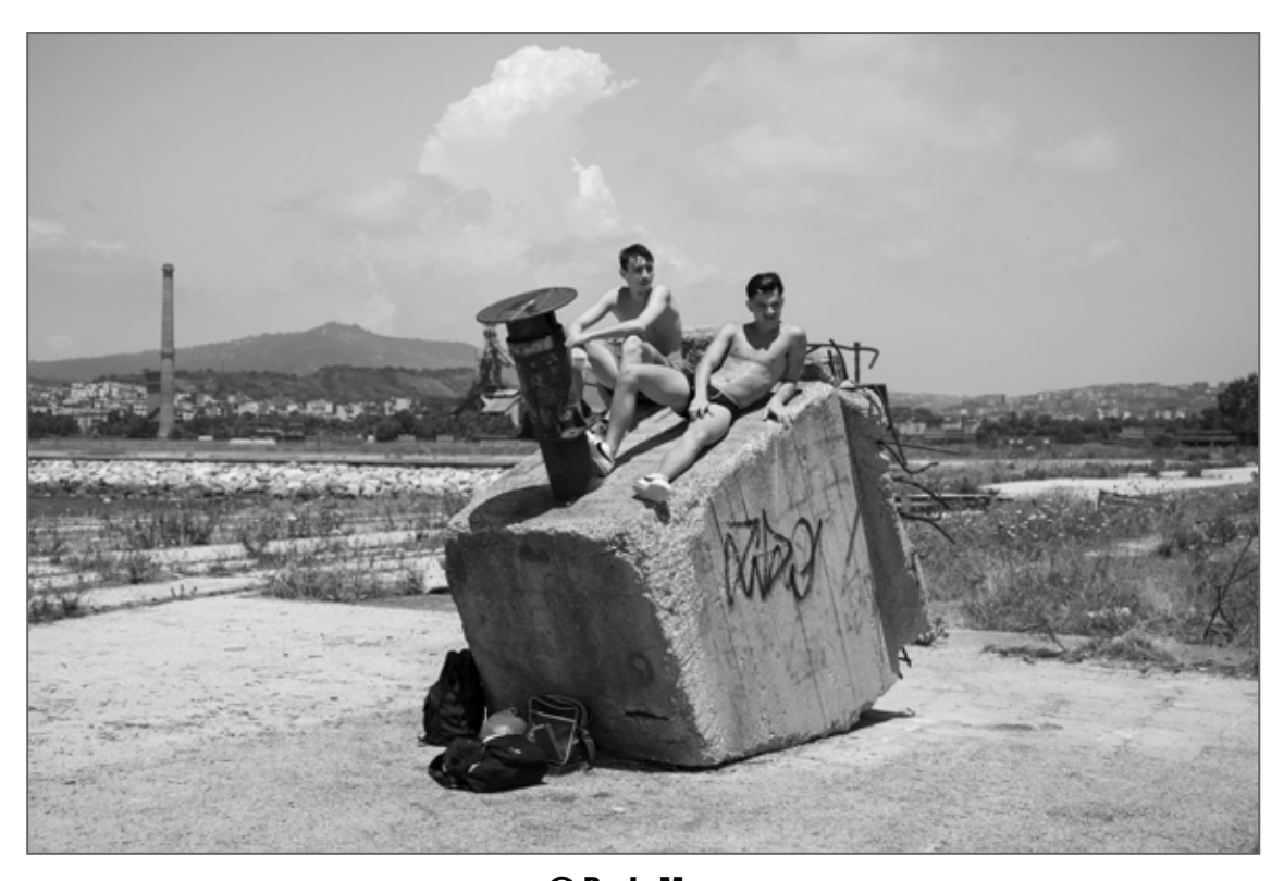
Winner of the 2023 Pierre & Alexandra Boulat Award

The photographic reportage on The Invisible City in the outskirts of Naples is an ongoing project spanning a period of more than twenty years. It presents a raw view of run down and abandoned areas in the city that have been neglected by the authorities. Individual stories as well as news events are portrayed through shattered lives, revealing hidden perspectives in the city.