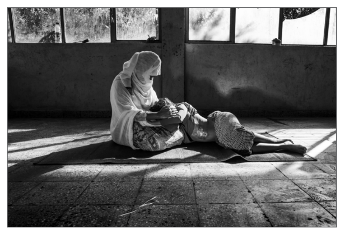
Winner of the 2023 Camille Lepage Award

The systematic targeting of women's bodies in war has come to light as a strategy used around the world. This project documenting the issue has focused on the war in Tigray that broke out in 2020. United Nations human rights experts have accused all parties involved of atrocities, some of them crimes against humanity. Eritrean armed forces used sexual violence as a weapon of war against both Eritrean and Tigrayan women, punishing Eritrean women for fleeing their country, and targeting Tigrayan women to exterminate them. Their bodies became battlefields.